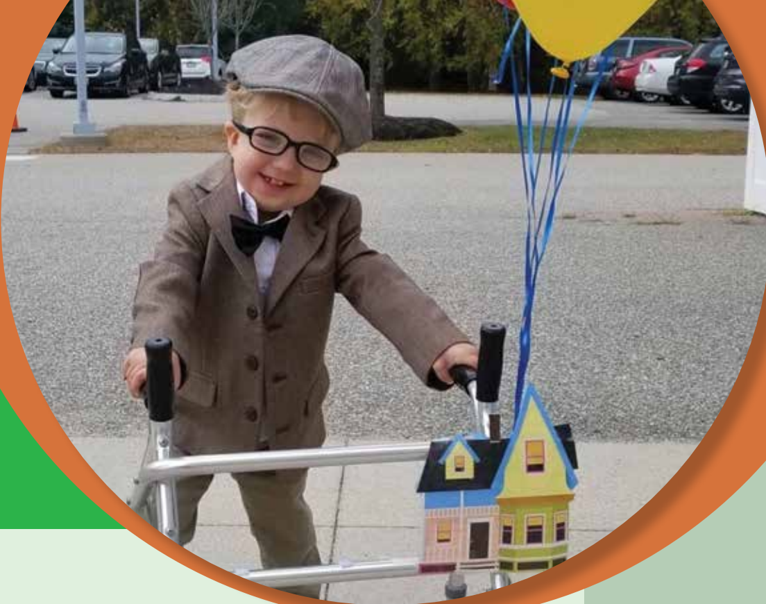
A student at Morrison Center's Special Purpose Preschool.