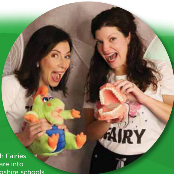
The Traveling Tooth Fairies bring oral health care into Nashua, New Hampshire schools.

In Vermont, a $68,750 Foundation grant helped purchase equipment for HealthHUB's new 42-foot mobile dental unit, "Rosie," which brought dental care to White River Valley schools. Another $35,000 grant was used by The Health Center, Plainfield to purchase digital sensors for mobile units and brick and mortar locations.