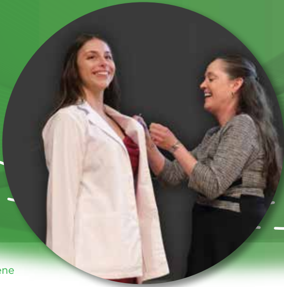
NHTI dental hygiene student pinning.