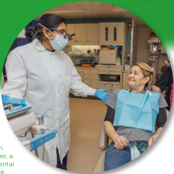
Harbor Care Health and Wellness Center, a Northeast Delta Dental Foundation grantee.