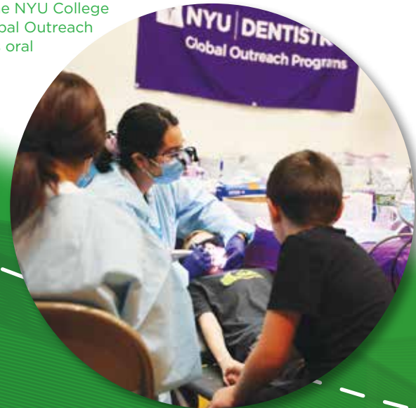
A student from the NYU College of Dentistry's Global Outreach program provides oral health care in Machias, Maine.