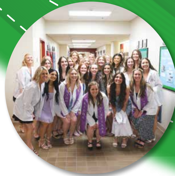
NHTI dental hygiene class of 2025.