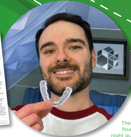
The recent JADA study found that use of adult night guards has increased.

Delta Dental Institute’s research article, “Oral health care use among an insured population after COVID-19,” appeared in the September 2025 Journal of American Dental Association (JADA) . The study found that preventive and diagnostic care rates have rebounded to near pre-pandemic levels. This is an encouraging success, as dental care usage had dropped significantly in 2020 and 2021, according to the original 2023 JADA article.