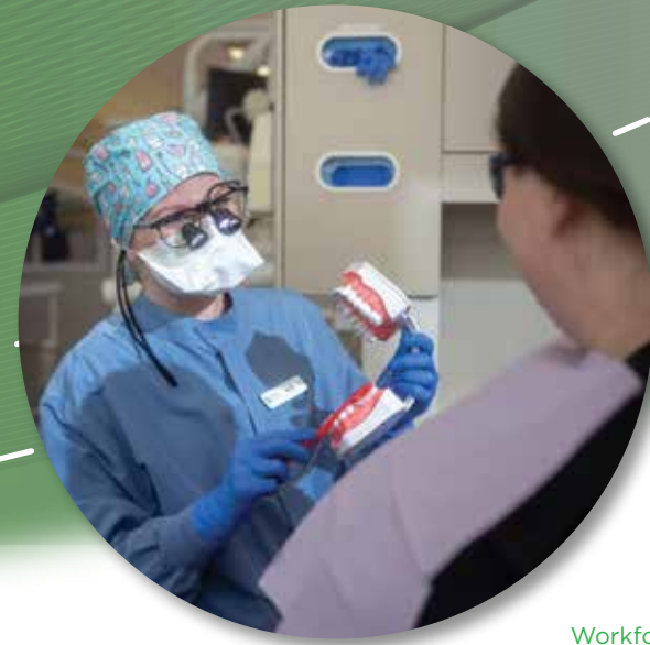
UMA Hygiene Workforce Fund recipient.

In 2025, Northeast Delta Dental gave $1 million in educational subsidies to address the critical post-pandemic workforce shortage. These funds reduced financial barriers for students who will eventually serve communities that urgently need oral health professionals.