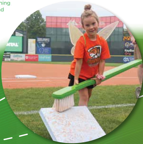
"Tooth Fairy" brushing a base at a Portland Sea Dogs game.

New Hampshire's Oral Health Challenge and Maine's Brush & Floss Challenge—both initiatives that encourage good oral health habits in kids—allowed youth to earn free baseball tickets to either the New Hampshire Fisher Cats or Portland Sea Dogs. Smiles all around!