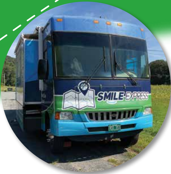
The Smile Express, a.k.a. "Rosie," is one of Vermont's mobile dental units.

Delta Dental Plan of Vermont 12 Bacon Street | Suite B Burlington, Vermont 05401-6140 802-658-7839 Fax 802-865-4430